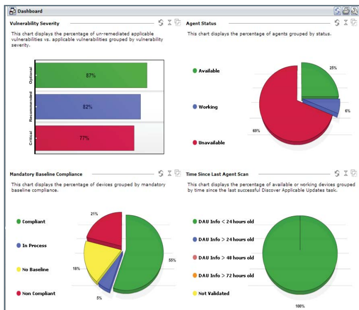
PatchLink Update - Dashboard View